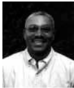
Gerald Henley Fox Cities Performing Arts Center