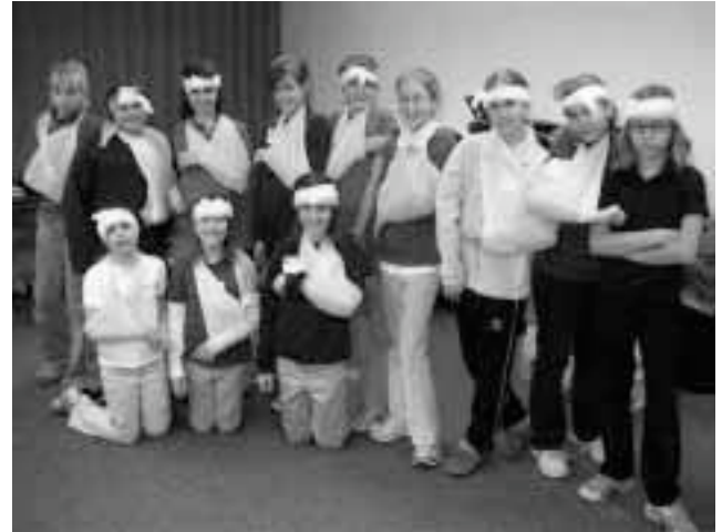
Students in the Babysitter's Training course learning how to bandage and immobilize an injured arm.