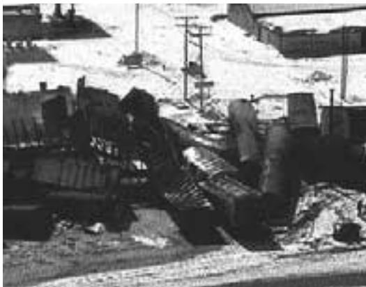
of the Weyauwega train derailment.

W hen preparing for a disaster, it's important to remember all members of our family. This includes our pets. Our pets enrich our lives in more ways than we can count. In turn, they depend on us for their safety and well being. March 4, 1996 started off as a normal day for most of the residents of Weyauwega, WI. Unfortunately, a train derailment caused the residents to evacuate their homes. What most thought would only be a few hours, turned into three weeks.