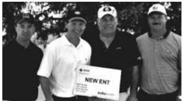
2003 Golf Classic winners, NEW ENT , for the second year in a row.